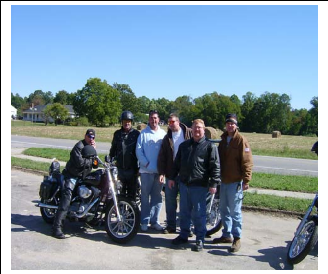
Our H-D guests seemed to enjoy the Poker Run but obdurately arrived at Stop 4 from the wrong direction.